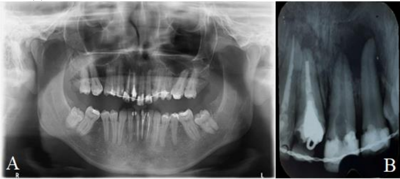
Figure 5 - Panoramic exam performed 21 days after the procedure (A). Periapical radiograph evidencing the radiolucent area in the apical region of units 21 and 22 and internal root resorption in unit 21 (B)

Imaging examination (panoramic and periapical radiographs of the lateral incisor and upper right canine and central incisors regions) showed an adequate reduction of the alveolar block and signs suggestive of periapical bone rarefaction in the apex region of dental units 21 and 22. Beyond that, internal root resorption was noted in dental unit 21 (Figure 5-A and B).