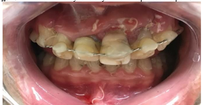
Figure 4 - Patient twenty-one days after the procedure performed

Twenty-one days after the procedure, the patient returned for outpatient reassessment, showing good healing, with intraoral 4-0 Vicryl sutures in position, clean and occluded, without signs of infection, dehiscence, and/or tissue necrosis. In addition, moderate dental stability was noted (Figure 4).